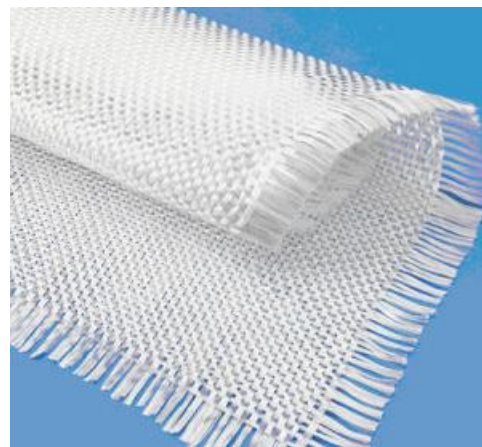
Fig 2: Woven Roving GFRP