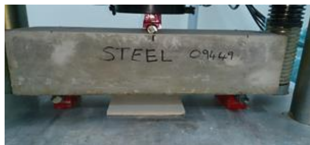
Fig 13: Flexural test on RC beam

The beam tests were using 100T UTM in the materials testing laboratory, Caledonian College of Engineering. Single point load was applied at mid span of the beams as shown in Figure 13. Simply supported conditions are maintained for all the beams with a span of 600 mm. Load was applied monotonically on the beam and corresponding deflection at mid span were noted.