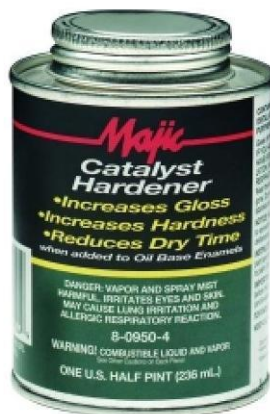
Fig 4: Hardener