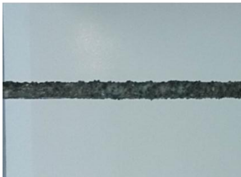
Fig 8: Sand coated GFRP bar

To increase the bond between GFRP bar and concrete, sand coating was applied on bars. Figures 7 and 8 show the GFRP plain and sand coated bars respectively. The Fibre is then cut into the 700 mm length for testing and to form the FRP reinforcement arrangements. Shear reinforcements also prepared based on using the same pultruded technology and reinforcement cage was prepared as shown in Figure 9. Also, form work for beam casting work also prepared using GFRP composites and shown in Figure 10.