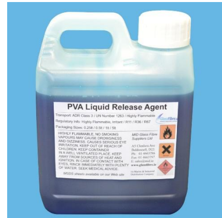
Fig 5: Poly-Vinyl Alcohol