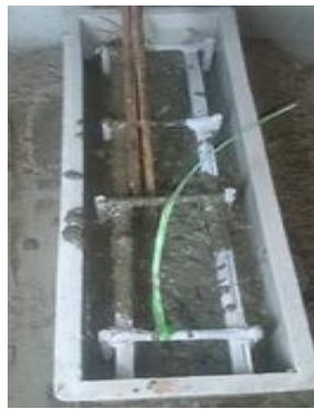
Fig 11: Concreting