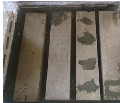
Fig 12: Curing