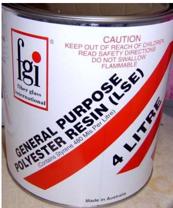
Fig 3: GP resin