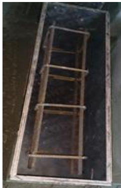
Fig 10: Reinforcement cage

Figure 10 shows the reinforcement cage for steel reinforced concrete beam. Concrete is pouring and compacting well as shown in Figure 11. After demoulding, all the four beams were kept in water tank for 28 days curing as shown in Figure 12.