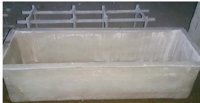
Fig 9: GFRP Formwork with rebar arrangements