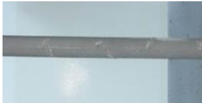
Fig 7: GFRP bar

To increase the bond between GFRP bar and concrete, sand coating was applied on bars. Figures 7 and 8 show the GFRP plain and sand coated bars respectively. The Fibre is then cut into the 700 mm length for testing and to form the FRP reinforcement arrangements. Shear reinforcements also prepared based on using the same pultruded technology and reinforcement cage was prepared as shown in Figure 9. Also, form work for beam casting work also prepared using GFRP composites and shown in Figure 10.