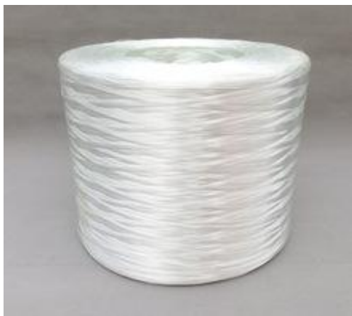
Fig 1: Long roving GFRP

The most common type of fibers used as reinforcement are carbon and glass. Fibers are of many patterns such as long roving (Figure 1), woven roving mesh (Figure 2) and chopped strand mat. In the present study, E-glass fiber mesh and long roving are used for the preparation of GFRP bar.