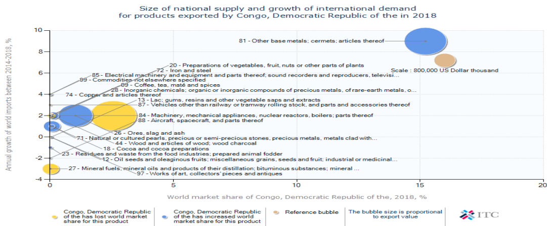
Fig 2: Products contributing to DR Congo export value