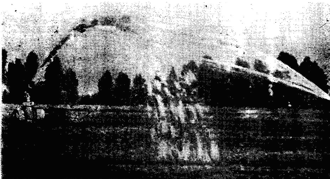
Fig.2 Demonstrations of the micro irrigation regime with the use of IDAH in conditions of irrigation of sugar beet, maize for power and soya in the Terter AIS of the Institute of "Agriculture".

The discharge was 20-30%, which led to uneven moistening. At the beginning of vegetation due to timely treatments, the surface discharge decreased (up to 8-10%). When the treatment of crops ceased, the discharge again reached 16-17%.