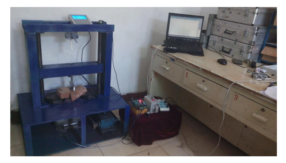
Fig 2: The experimental set-up photograph of brick measurement.

limit in the encoder motor. The motor shuts off and disengages all applied torque when a certain error limit is reached. Its internal PID filter (proportional, integral, and derivative) keeps track of exactly where the motor should be and it compares this with the data coming in from the encoder. Any discrepancy is stored as error. This error accumulates while the motor is in servo mode. When the error limit is exceeded the motor is automatically shut off and all torque gets released. If the testing arm tries to move and is unable to do so, it accumulates error and will eventually shut-off. This eliminates concern for a runaway motor crushing up against the top or bottom of the apparatus. The experimental set-up photograph of brick measurement and the electronic drive control system is shown in Figure 2.