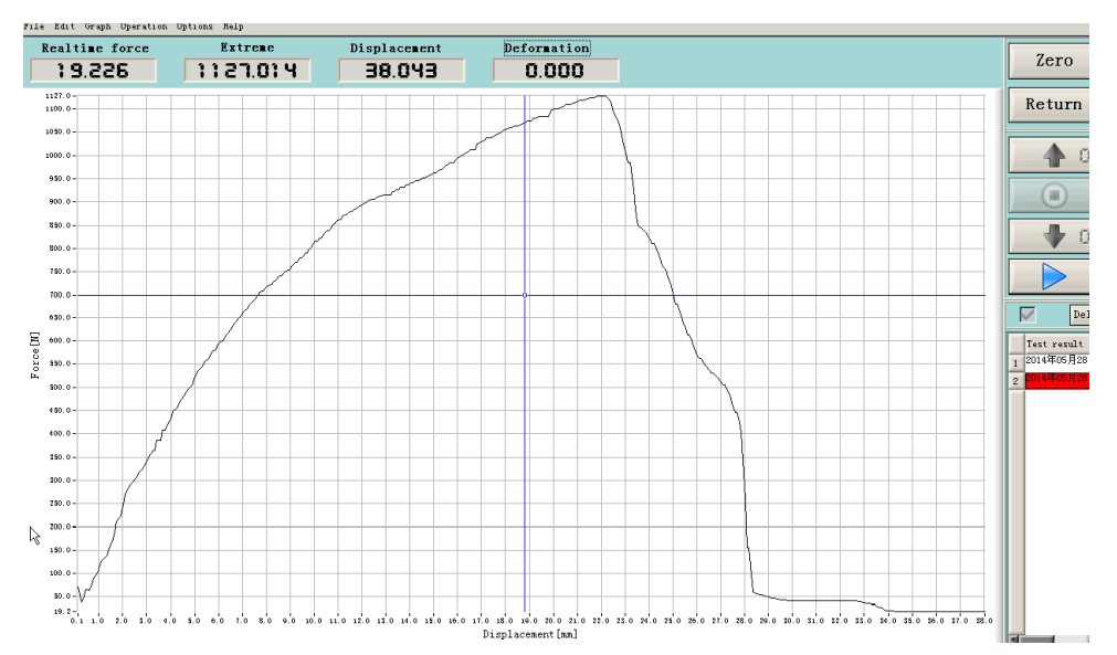
Fig 3: The system main software interface displaying force-displacement curve for the plastic strip specimen.

Two samples of plastic strip (fiber-reinforced polymer) specimens with an area of 55 mm2 and 100 mm length were subjected to tensile and elongation tests. As seen in Table 1, the average maximum force was 11.9019 N, the average deformation was 15.4679 mm, the average tensile was 0.2164 MPa and the average elongation was 15.4679%. Initially, system configuration and parameters settings were performed with standard values. The tensile and elongation values are calculated by the formulas 1 and 2 respectively. The data for this plastic strip shows that as the current input increases, the voltage output demonstrates a linear trend as expected.