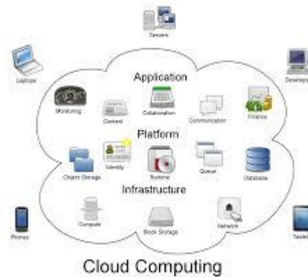
Figure 1:cloud computing