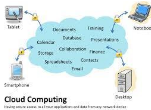
Figure 2: Finance(e_accounting with cloud computing)

delivery and the consumer utilization model. In the background, service provider's uses particular technologies, system architecture, design and industry best practices to provide and support the delivery of service-oriented, elastically scalable environment serving multiple customers. This helps end users to have more agile and flexible service oriented architecture for their application and services. In a conventional IT scenario, most software companies have procured different components of their application middleware infrastructure layer from various vendors, and brought together these tools into a corporate environment using system integration services and tools. On the other hand, in a Cloud computing scenario, this practice is quite rare. Platform-as-a-Service solutions provide environment and applications development platforms for seamlessly integrating Cloud computing into existing application, services, and infrastructure with a market-oriented approach.