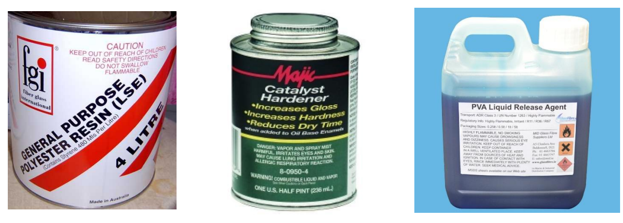
Fig 5: Poly-Vinyl Alcohol