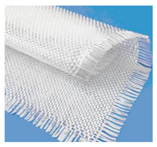
Fig 2: Woven Roving GFRP