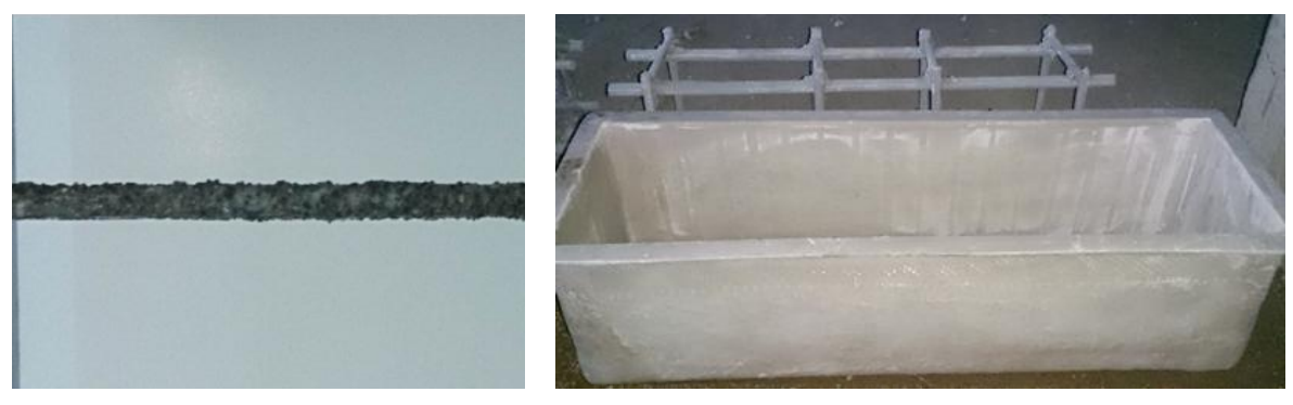
Fig 8: Sand coated GFRP bar

To increase the bond between GFRP bar and concrete, sand coating was applied on bars. Figures 7 and 8 show the GFRP plain and sand coated bars respectively. The Fibre is then cut into the 700 mm length for testing and to form the FRP reinforcement arrangements. Shear reinforcements also prepared based on using the same pultruded technology and reinforcement cage was prepared as shown in Figure 9. Also, form work for beam casting work also prepared using GFRP composites and shown in Figure 10.