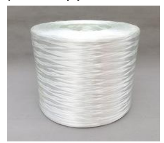
Fig 1: Long roving GFRP

The most common type of fibers used as reinforcement are carbon and glass. Fibers are of many patterns such as long roving (Figure 1), woven roving mesh (Figure 2) and chopped strand mat. In the present study, E-glass fiber mesh and long roving are used for the preparation of GFRP bar.