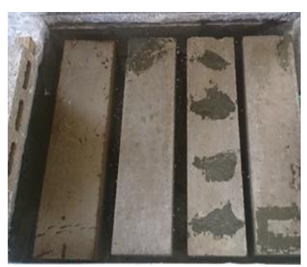
Fig 12: Curing