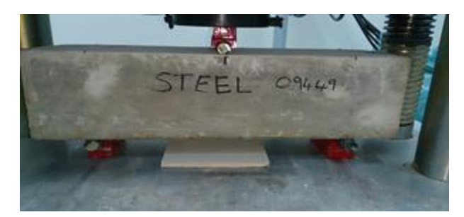
Fig 13: Flexural test on RC beam

The beam tests were using 100T UTM in the materials testing laboratory, Caledonian College of Engineering. Single point load was applied at mid span of the beams as shown in Figure 13. Simply supported conditions are maintained for all the beams with a span of 600 mm. Load was applied monotonically on the beam and corresponding deflection at mid span were noted.