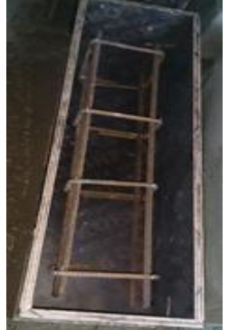
Fig 10: Reinforcement cage

Figure 10 shows the reinforcement cage for steel reinforced concrete beam. Concrete is pouring and compacting well as shown in Figure 11 . After demoulding, all the four beams were kept in water tank for 28 days curing as shown in Figure 12.